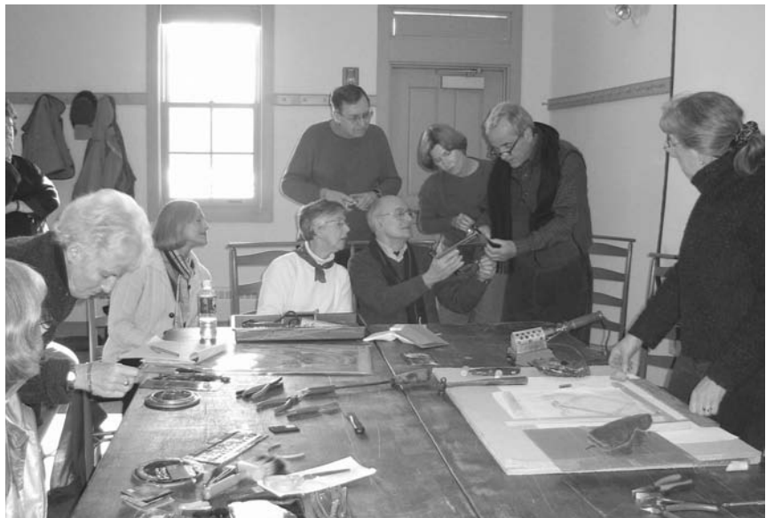
Stained Glass Class, Winter 2005