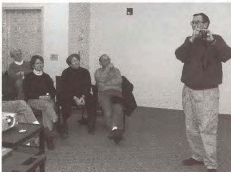
Dick Degenhardt-Digital Photography