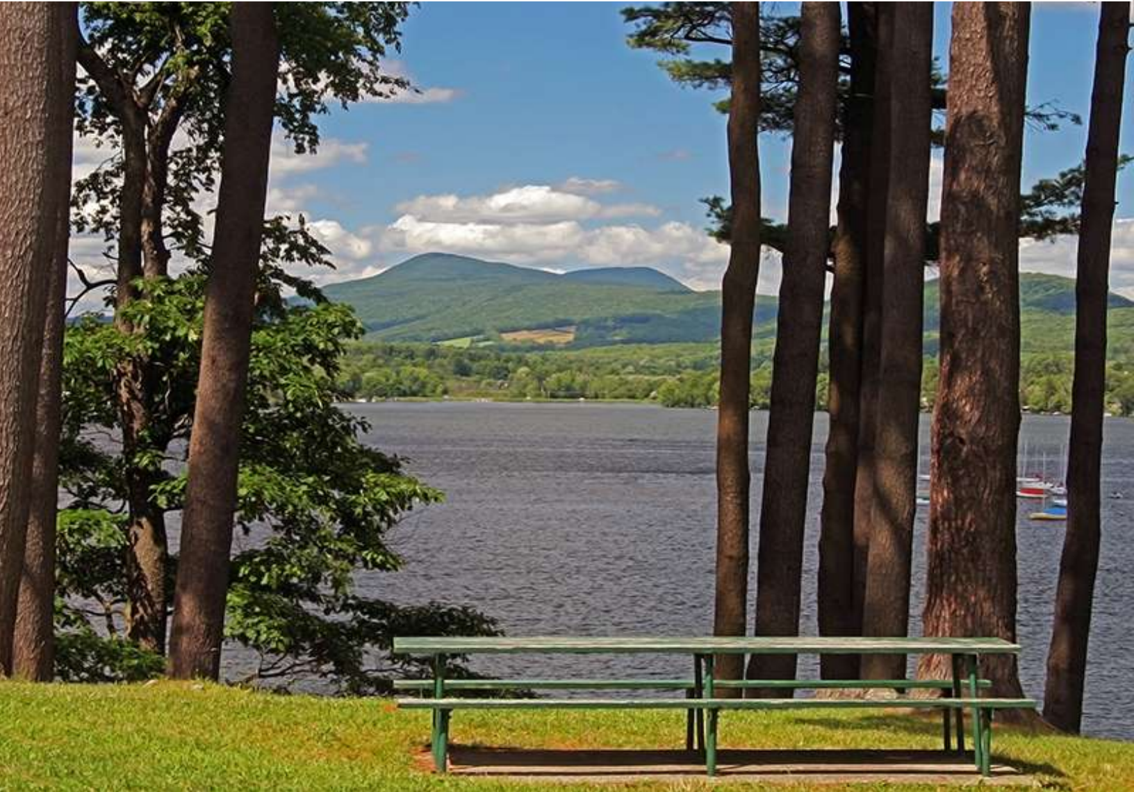
"1898 Old Saddleback"