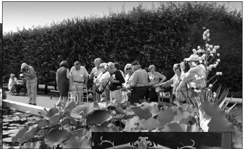
OLLI Group Visit to The New York Botanical Gardens