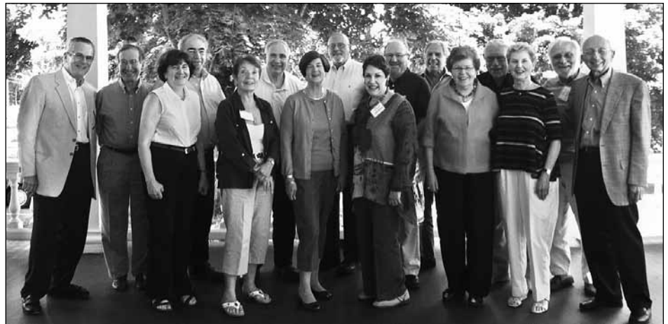
First Leadership Development Program Participants