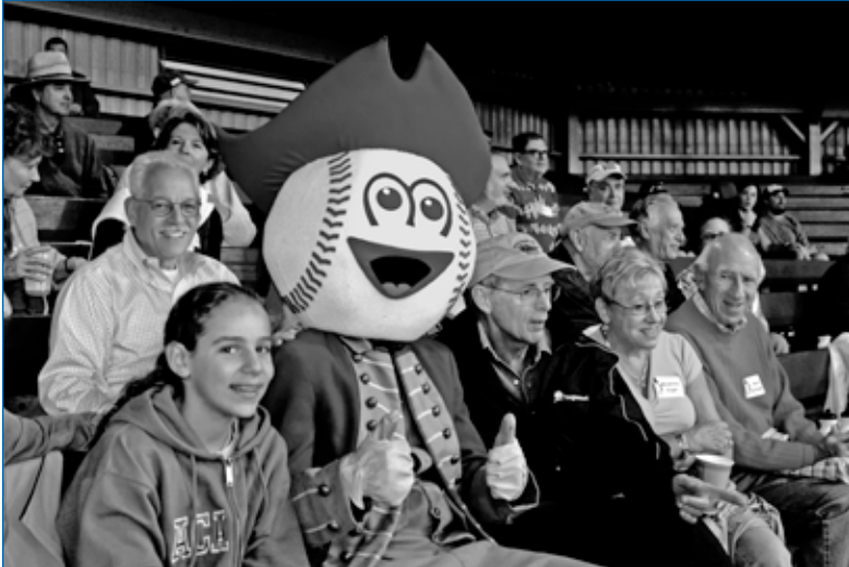
Members and Guests With Colonials' Mascot