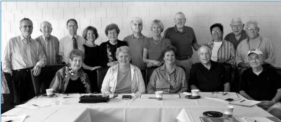
Leadership Development Seminar at BCC, September 9