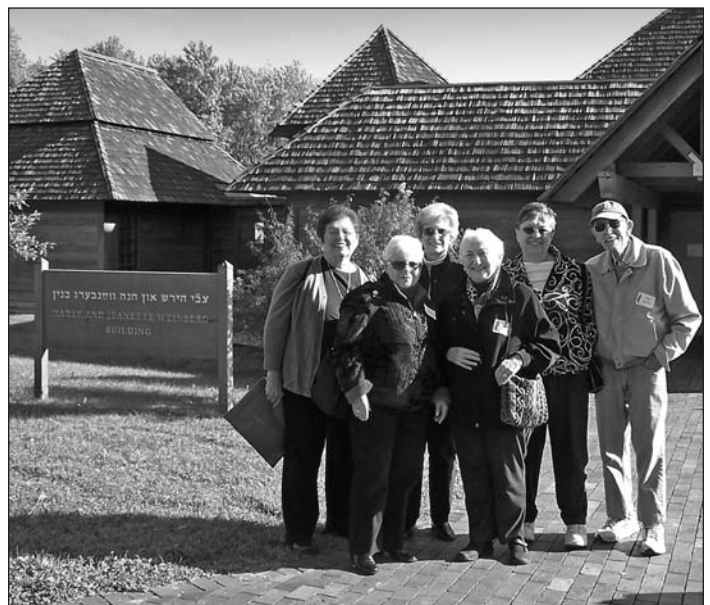
Special Events visit to the National Yiddish Book Center Northampton, October 2008