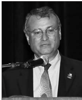
James Ruberto Mayor of Pittsfield