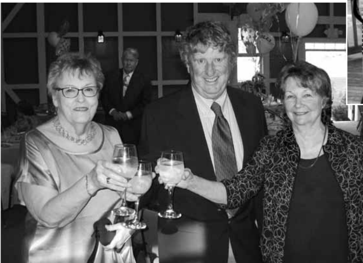
OLLI Members Enjoying the Evening!