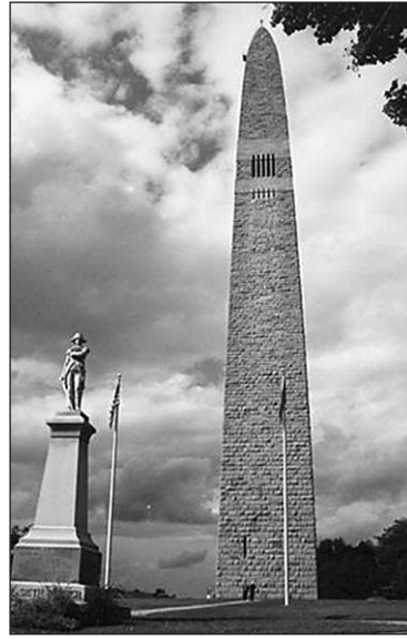
Battle of Bennington Monument

Information gathered from articles, papers and books in the Berkshire Athenaeum's Local History Department.